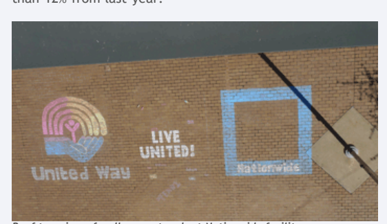
Roof top view of walkway artwork at Nationwide facility Nationwide held a "Chalk the Walk" event. Associates were encouraged to go outside and sign their name in support of United Way.

Innis Maggiore's campaign was kicked off on national "Talk Like A Pirate" day. Their campaign increased more than 12% from last year.